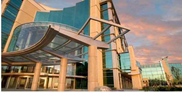
THE HUNTSMAN CANCER INSTITUTE, IN SALT LAKE CITY, HAS TWO MISSIONS: TO LOCATE A CURE FOR 200 TYPES OF CANCER AND TO EXTEND THE QUALITY OF LIFE FOR PATIENTS.

the course is playable for me. There are many risk-reward opportunities and I have to think about every shot. The course explodes with the colors of nature every spring,” beamed David. “Native green willows, red twiggled dogwoods, and thousands of blooming potentilla bushes make you pause every so often just to take in the scenery.”